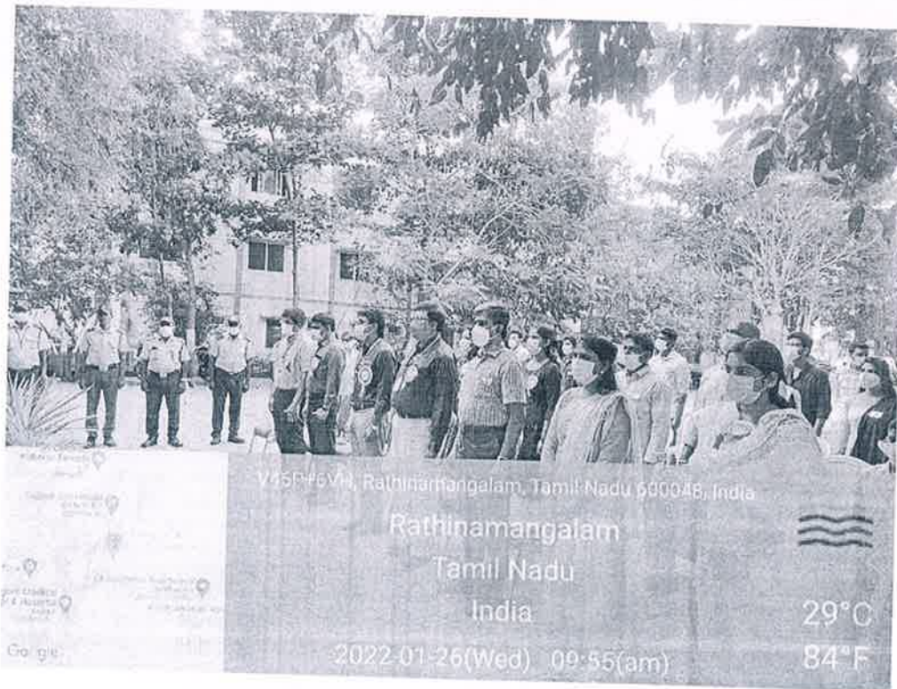
STAFF AND STUDENT BODY GATHERING